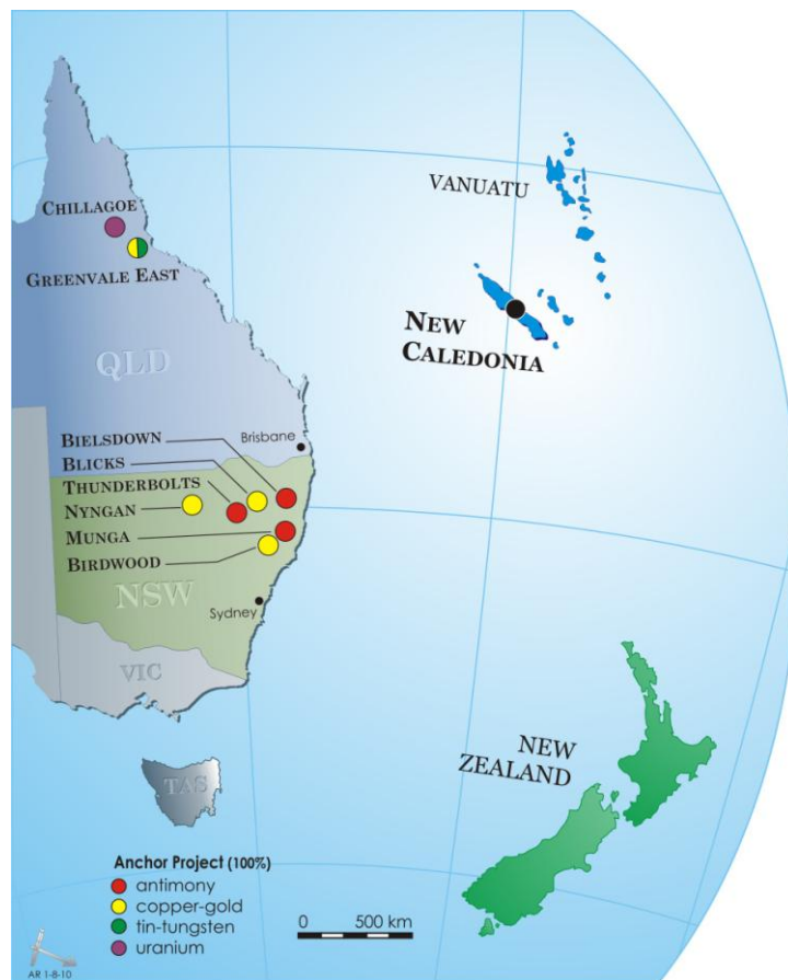
Figure 1: Anchor Project Locations

During the past year, Anchor Resources moved into new corporate headquarters in Sydney.